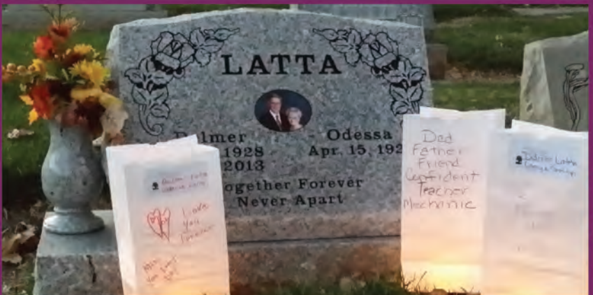
Reflections of Love Luminary Event In November