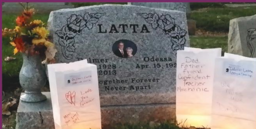
Reflections of Love Luminary Event In November