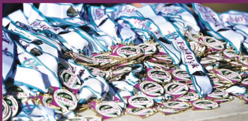
Fab 40's 5k Run/Walk Benefitting the Alzheimer Association In July