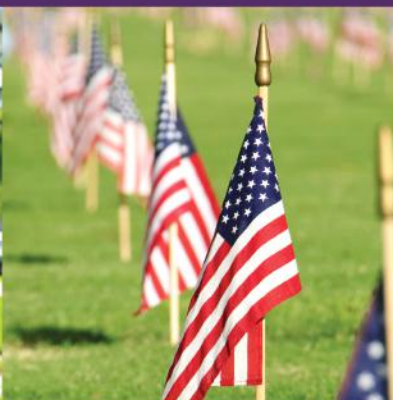
Memorial Day Every May