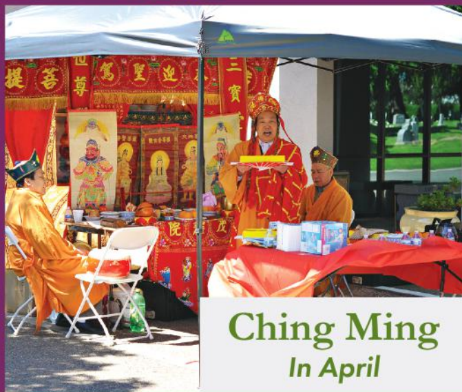
Ching Ming In April